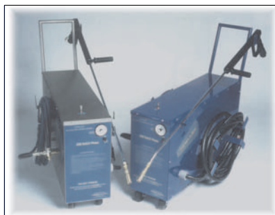
Ultra 250E / 600E