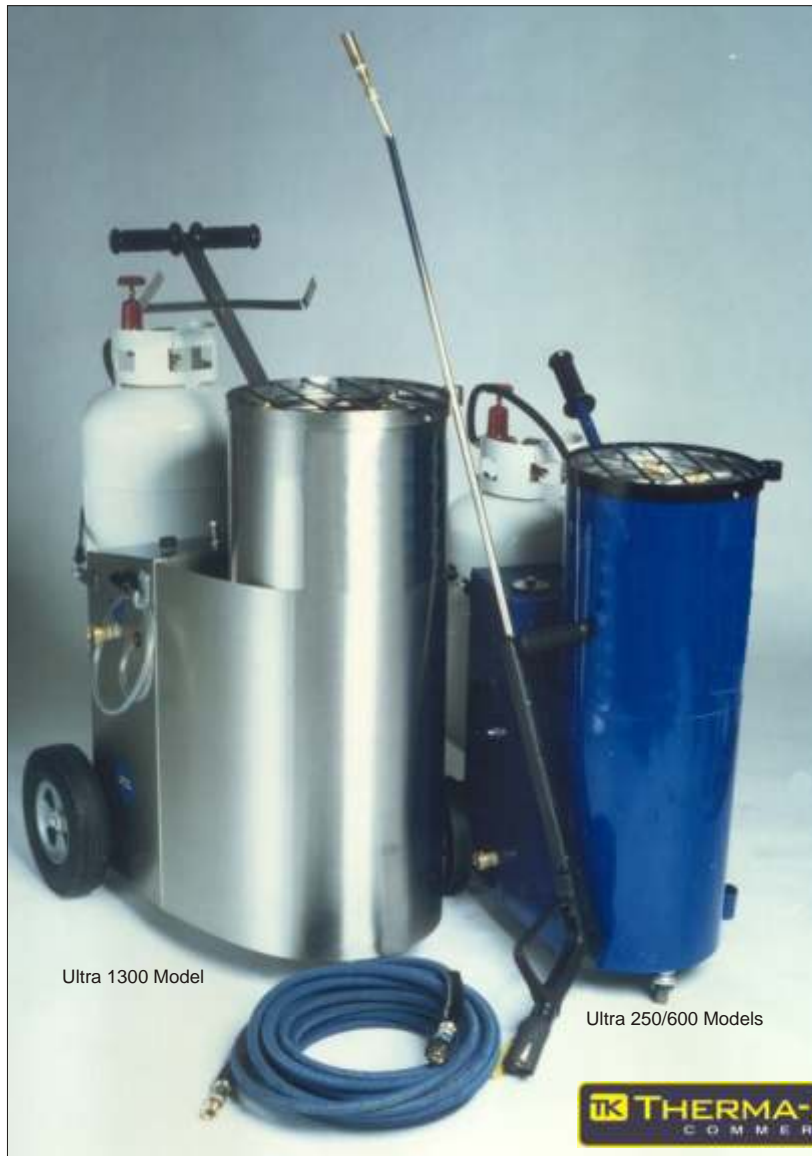
Ultra 1300 Model