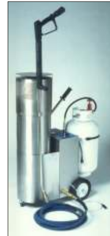
Ultra 600 with heat deflector and external chemical injection system.