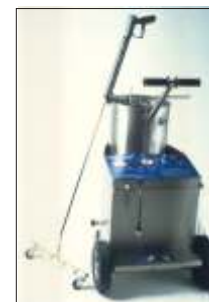
Water Broom shown with back view of the Ultra 1300 model.